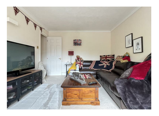
£1,300 Per Month - 4th January 2025